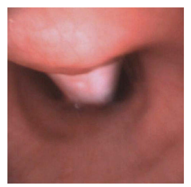
aScope 3 aView monitor view of PDT

CONCLUSIONS. Our evaluation demonstrated that the Ambu<sup>®</sup> aScope<sup>TM</sup> 3 system was assessed as easy to use and performs satisfactorily for guiding PDT in critically ill patients. The system is portable and easy to position for the bronchoscopist and clinician performing PDT to view. The monitor display is smaller and of lower resolution (800 \times 480 \text{ pixel}, 8.5 \text{ monitor}) inch colour TFT LCD screen) than our non-disposable system, but image quality was good enough to guide the procedures and the smaller monitor could be positioned flexibly at the bedside. Suction capabilities were adequate. The lowest scores were in relation to the functionality of the aView<sup>TM</sup> monitor, which had pre-release software installed. The lightweight handle was not perceived as a particular advantage. The disposable nature of the system may have cost advantages, especially when considering potential damage to bron-choscopes during PDT. One patient had cavitating lung lesions which illustrates an example of potential infection control advantages over non-disposable equipment.