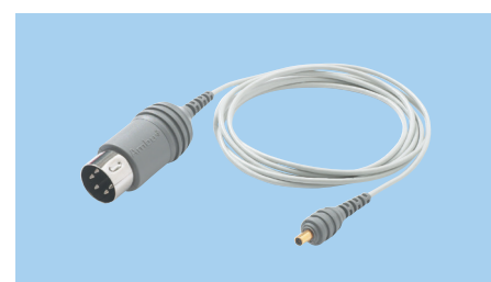
Ambu® Neuroline™ Concentric cable

The reusable Ambu® Neuroline™ Concentric cable has an orientation-free connection to the needle electrode and fits EMG equipment featuring a DIN (60130-9) connector. The cable is shielded, flexible, and can be reused up to 2000 times.