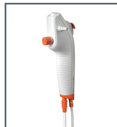
The ergonomic and lightweight handle is designed to give you a firm and comfortable grip