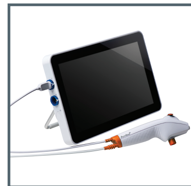
Ambu aScope 4 Broncho Large and Ambu aView 2 Advance