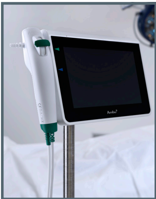
Ambu® aScope™ 4 Broncho Regular and Ambu® aView™