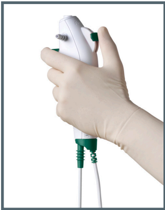
The ergonomic and lightweight handle is designed to give you a firm and comfortable grip