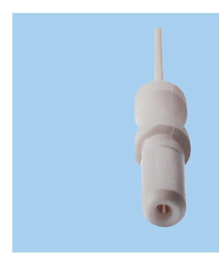
K = 1.5 mm connector