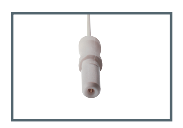
K = 1.5 mm connector