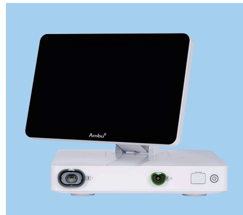
The compatible Ambu aBox 2 display and processing unit

Dual-function configurable buttons for control of key endoscope functions