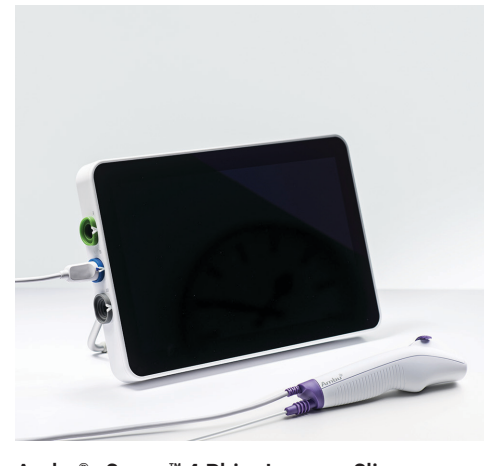
Ambu® aScope ^{\text{™}} 4 RhinoLaryngo Slim and Ambu® aView ^{\text{™}} 2 Advance