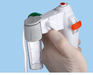
Switch from suctioning to sampling by the flip of a switch