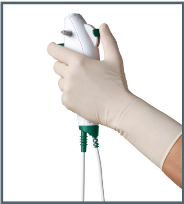
The ergonomic and lightweight handle is designed to give you a firm and comfortable grip