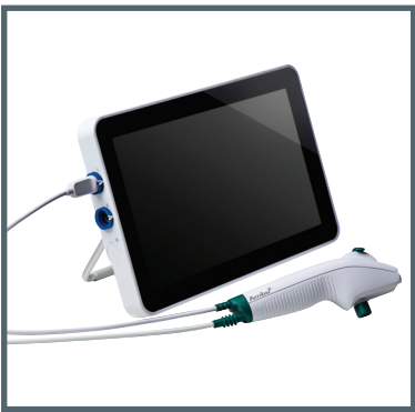
Ambu aScope 4 Broncho Regular and Ambu aView 2 Advance