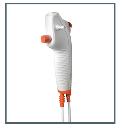
The ergonomic and lightweight handle is designed to give you a firm and comfortable grip