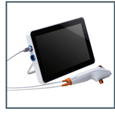
Ambu aScope 4 Broncho Large and Ambu aView 2 Advance