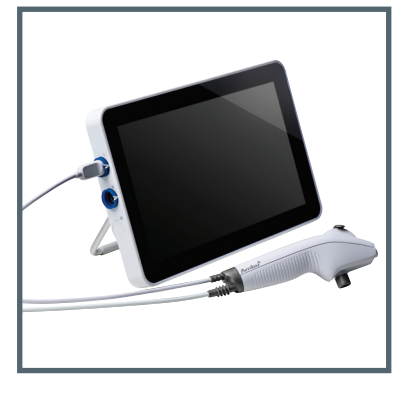
Ambu aScope 4 Broncho Slim and Ambu aView 2 Advance