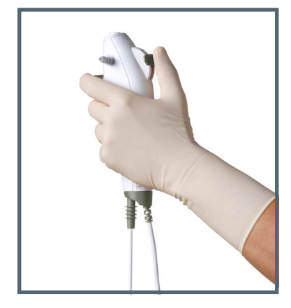
Ergonomic and lightweight handle designed to give you a firm and comfortable grip