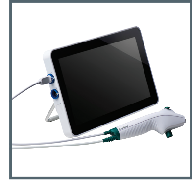
Ambu aScope 4 Broncho Regular and Ambu aView 2 Advance