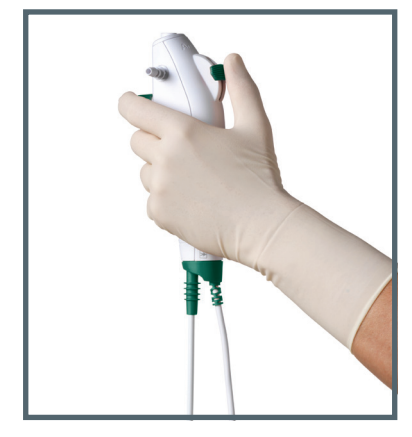
The ergonomic and lightweight handle is designed to give you a firm and comfortable grip