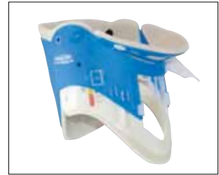
Ambu Redi-ACE Adult