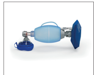
Ambu Silicone Face Mask connected to Ambu Silicone Resuscitator