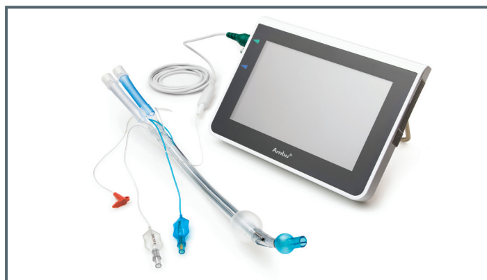
VivaSight-DL connected to Ambu® aView™ monitor

Manufactured by ETView Ltd. Catom 2 Street Misgav Business Park M.P. Misgav 2017900 Israel