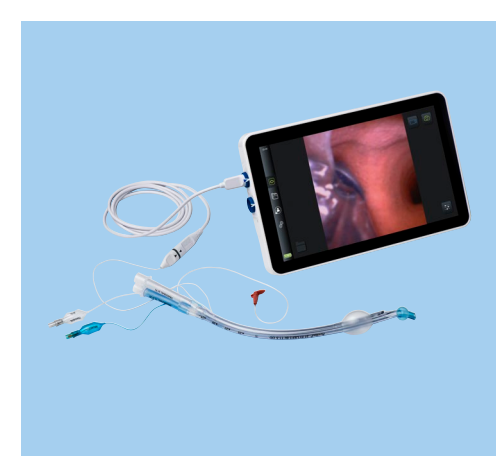
Ambu<sup>®</sup> VivaSight<sup>™</sup> 2 DLT connected to Ambu<sup>®</sup> aView<sup>™</sup> 2 Advance Monitor.