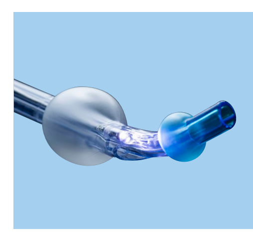
Ambu® VivaSight™ 2 DLT.