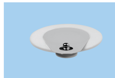
S = Stud