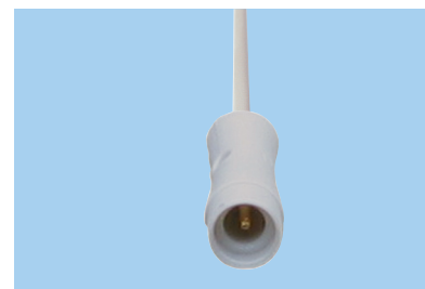
SC = 0.7 mm connector