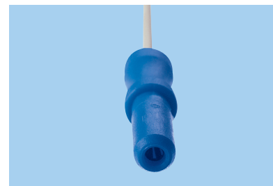
J = 2 mm connector