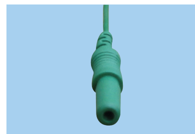
M = 1.5 mm connector