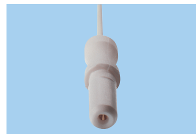
K = 1.5 mm connector

LBL-005609 - V03 - 2023/07 - Ambu A/S. Technical data may be modified without further notice. TCC 11515