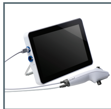
Ambu aScope 4 Broncho Slim and Ambu aView 2 Advance