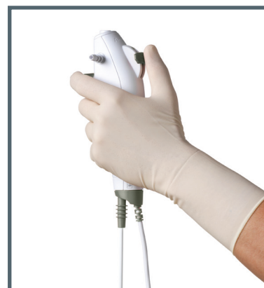
Ergonomic and lightweight handle designed to give you a firm and comfortable grip