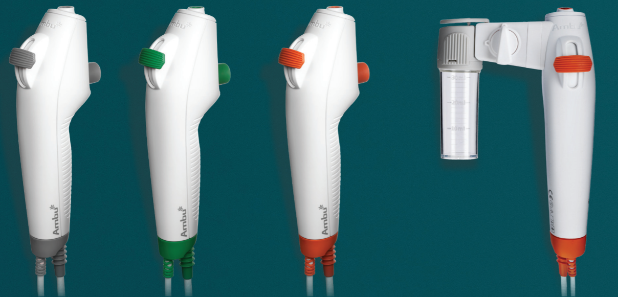
aScope 4 Broncho Slim 3.8/1.2 180°/180°

This forward thinking design enables you to upgrade and take advantage of the latest imaging capabilities, advanced features and future Ambu endoscope releases. Repair options are available to help extend the lifetime of your investment, if an unexpected problem should occur.