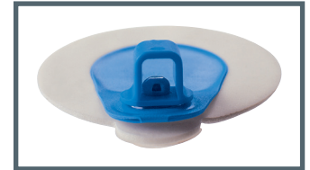
A = 4 mm fitting